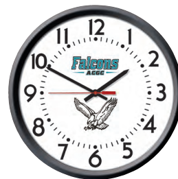
Free Personalized Dials

The Wi-Fi Clock Series from American Time offers a selection of clocks to match a variety of applications. These clocks have durable cases and crystals, as well as easy viewing faces.