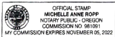
Notary Public-State of Oregon